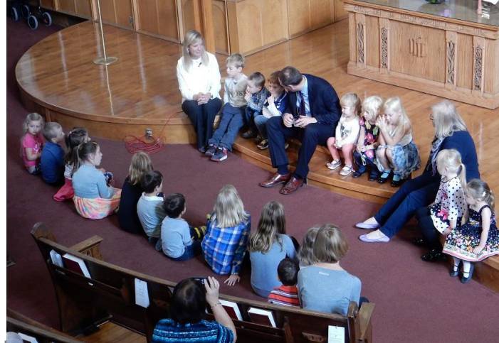
The children are gathered for story & prayer.

We praise God and experience God’s presence with us.