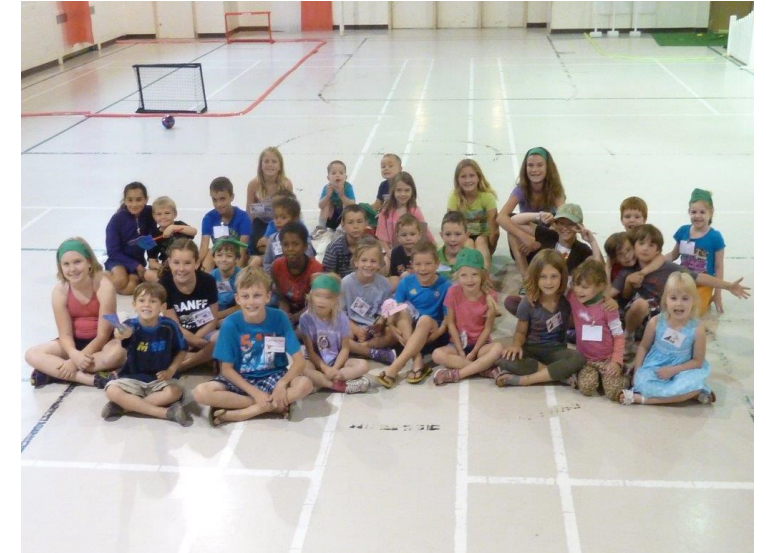
2014 VBS Camp Awesome campers.

We grow in our relationship with God and in our likeness to Jesus.