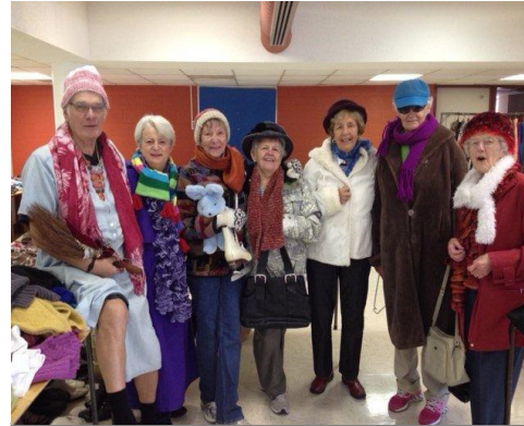
Collier's Closet clothing drive

We follow the example of Jesus and grow closer to God by working to meet the needs of others.