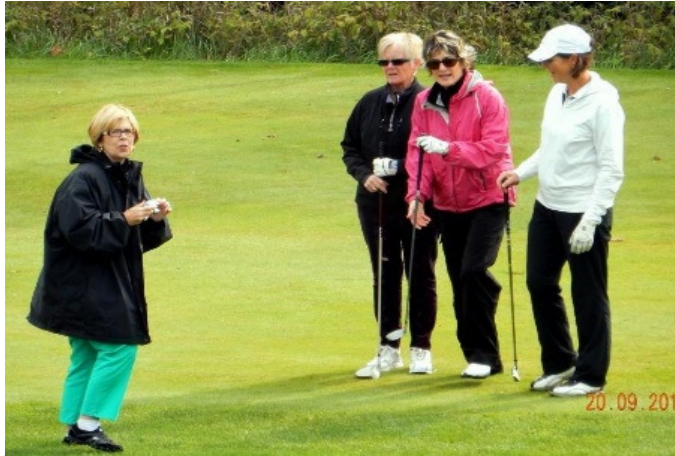
Friends enjoying Collier's golf tournament.

God calls us into community. We live this out by spending time together and being there for each other.