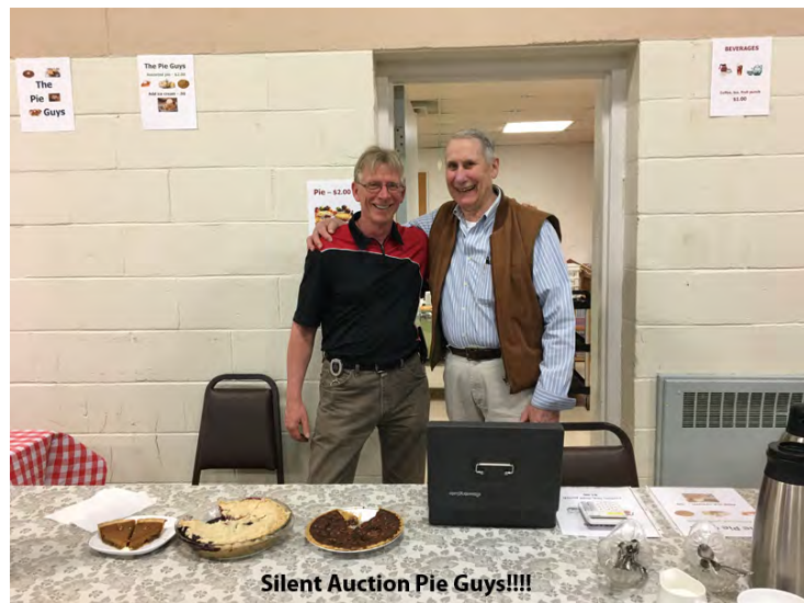
Silent Auction Pie Guys!!!!