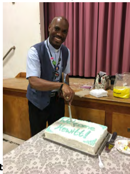
Collier St Trustees effective May 01, 2017