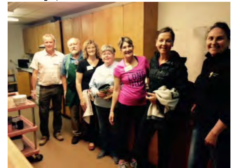
Collier volunteers for BOOTC