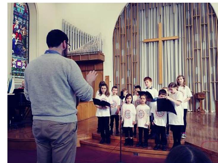
Collier Choir School rehearsing