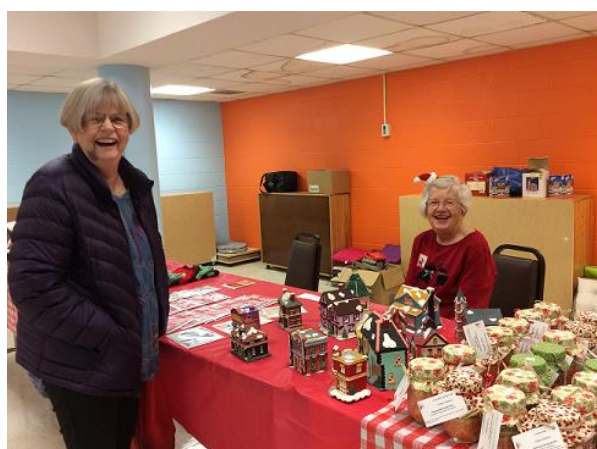
Crafts and goodies being sold at the Christmas Bazaar