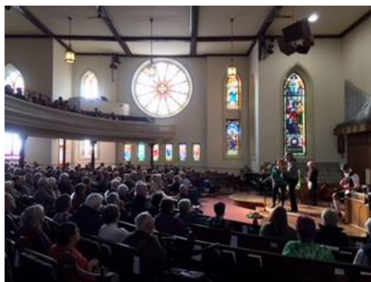
"Pagan's Folly" March 18th