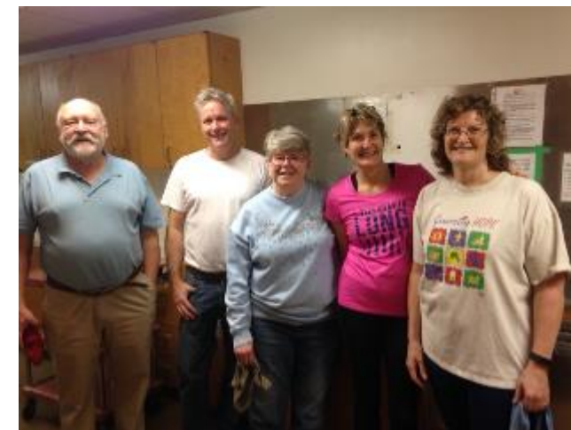
Barrie Out Of The Cold volunteers at Collier