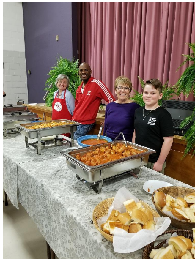
Silent Auction Pasta Dinner Volunteers