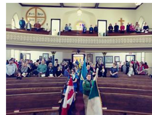
Baden Powell Sunday

The Quarterly LINK Newsletter of Collier Street United Church