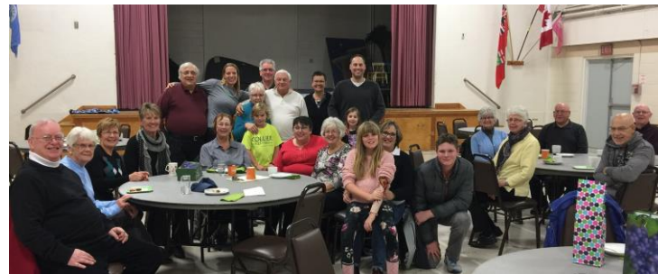
October 28 th Scavenger Hunt participants.