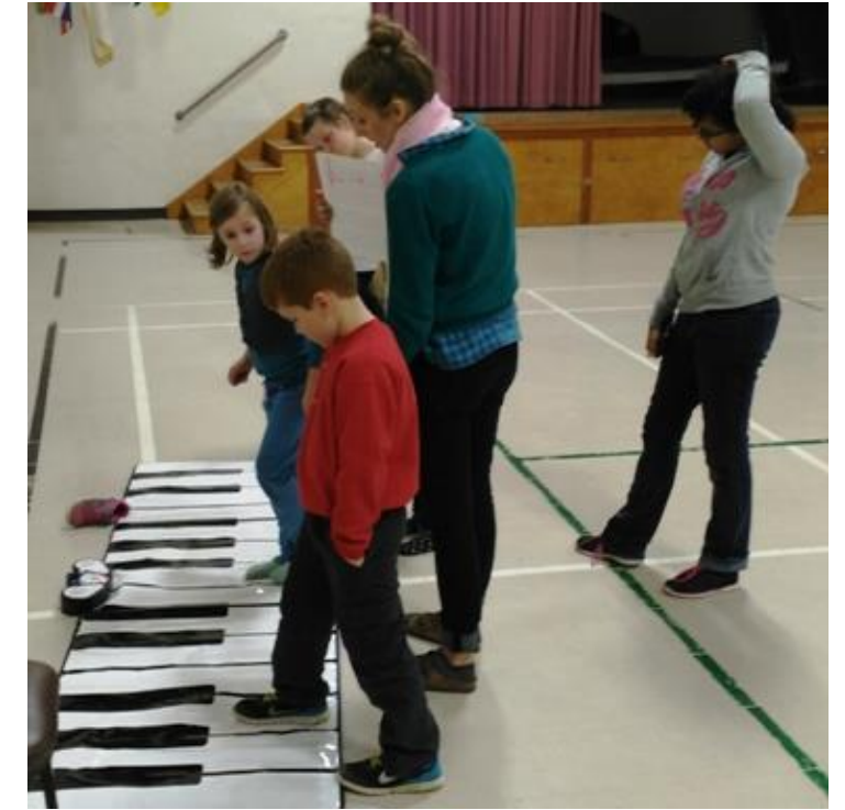
Collier's Choir School