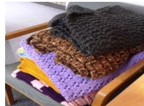
These shawls are being donated to the spiritual care team at RVH.

Much of our wool is donated by members of the congregation and we appreciate the continued support and encouragement given to our ministry.