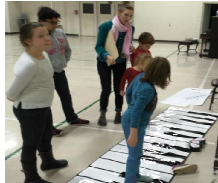
Collier's Choir School