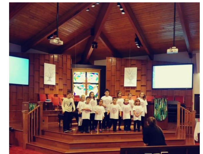
Collier Street Choir School performing at Grace United for the Ontario Registered Music Teachers Assoc.

The Quarterly LINK Newsletter of Collier Street United Church 112 Collier Street, Barrie, Ontario L4M 1H3 705-726-1511 www.collierunited.ca