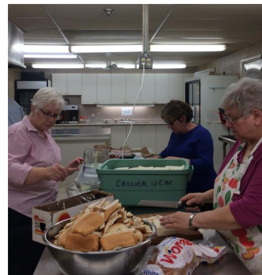
Christmas Fair lunch preparations before the big event.