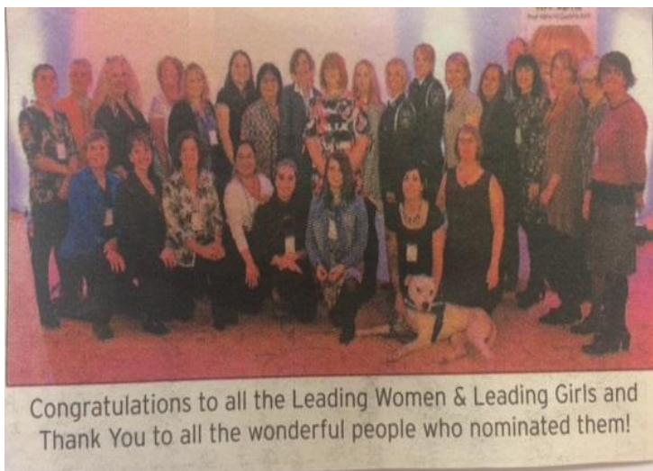
Congratulations to all the Leading Women & Leading Girls and Thank You to all the wonderful people who nominated them!