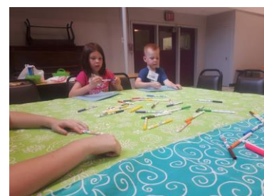
Camp Awesome Summer 2108