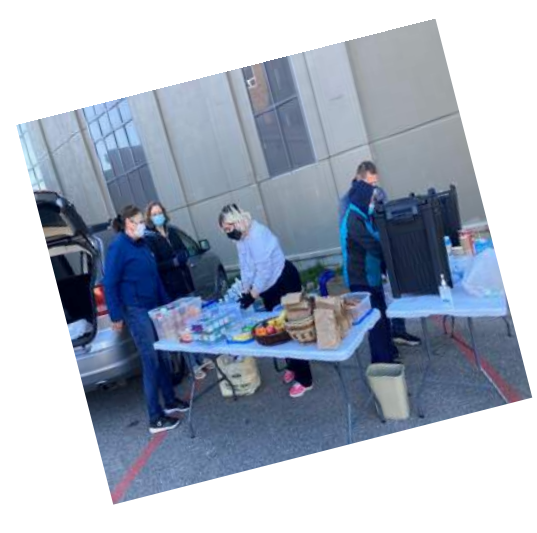
We are helping with Breakfast To Go