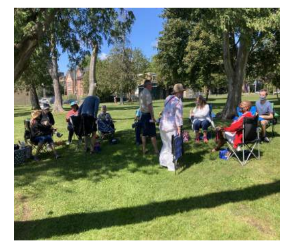
Outdoor service St. Vincent Park